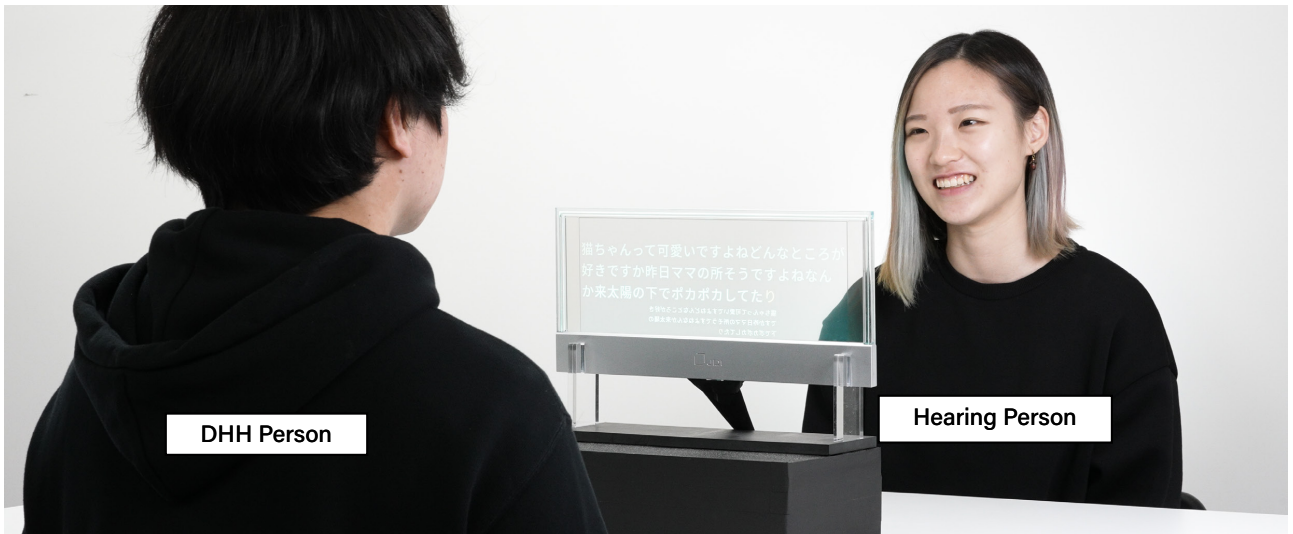
Figure 1: Proposed real-time captioning system.